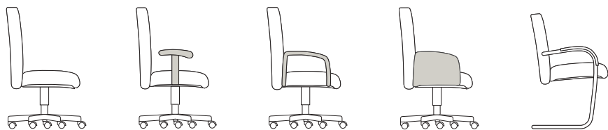
Armless T Arm Loop Arm Box Arm Sled Base